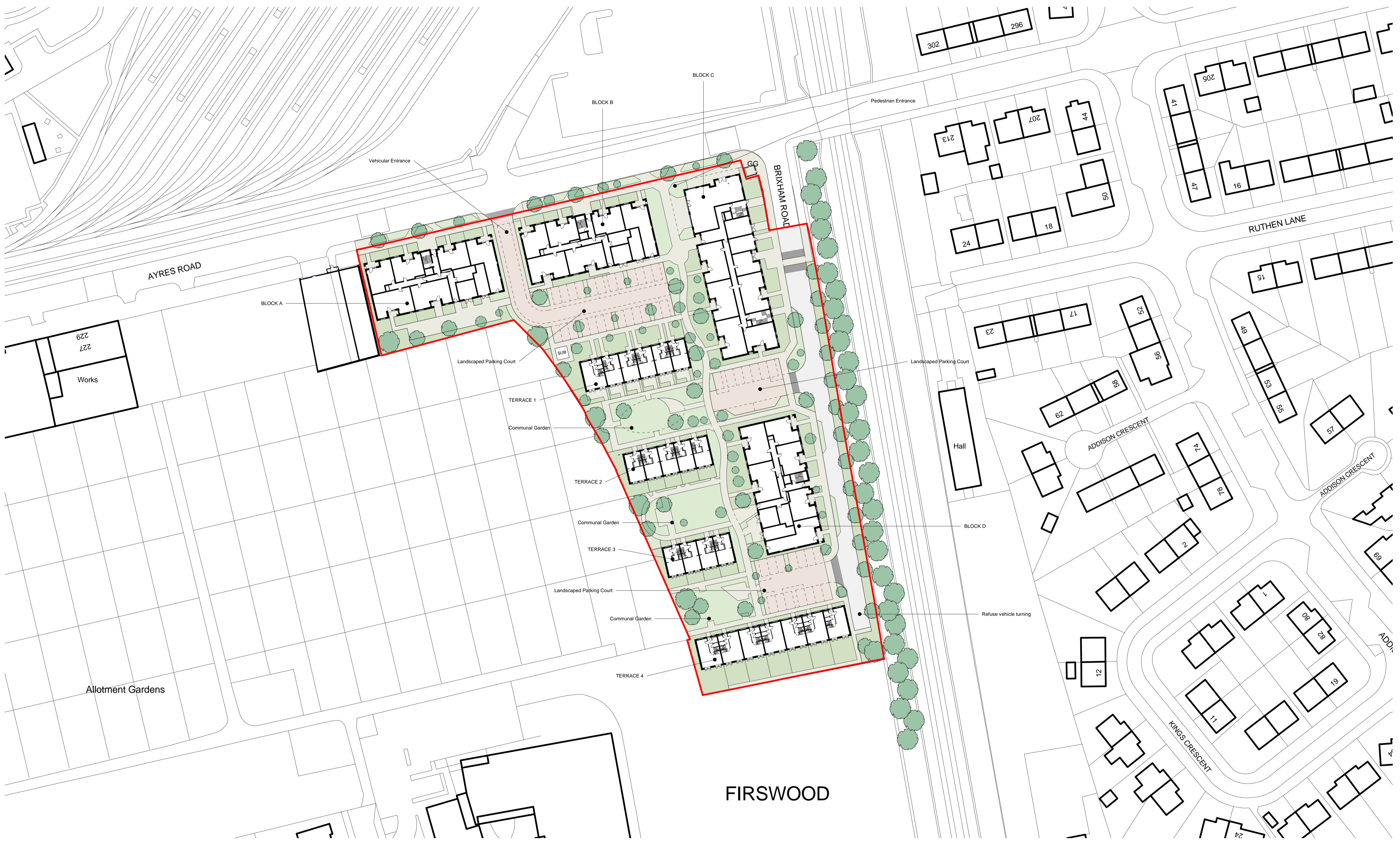
1 00 - Proposed Site Plan Ground 1 : 500